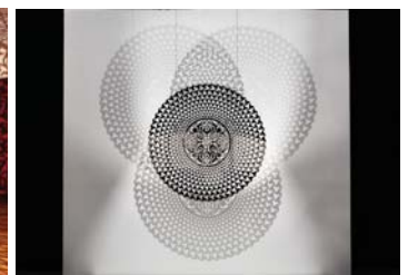
Anila Quayyum Agha, Flight of a Thousand Birds, 2018/2019.