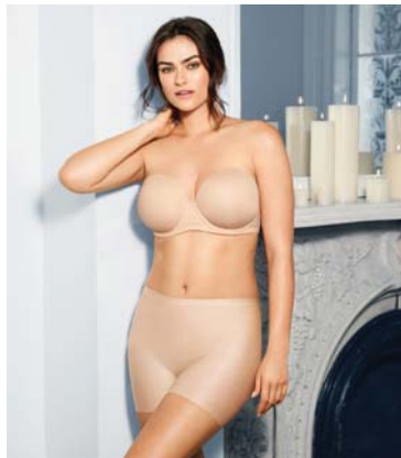
Wacoal's Red Carpet Strapless

which way. Ideal under strapless, criss-cross, halter, and one-shoulder dresses, the Red Carpet bra will have you feeling like a star during your holiday soirees. Available in band sizes 30-42 and cup sizes B-H. If your strapless is falling down, then you're probably not wearing the correct size! Our bra fit specialists will help you find the perfect fit for every outfit.