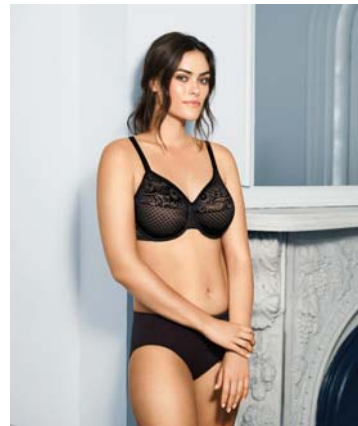
Wacoal Visual Effects

Strapless and Sports bras are great to have in your wardrobe, but don't forget to leave room for your everyday basics. Our newest guest favorite is the Wacoal Visual Effects minimizer bra!