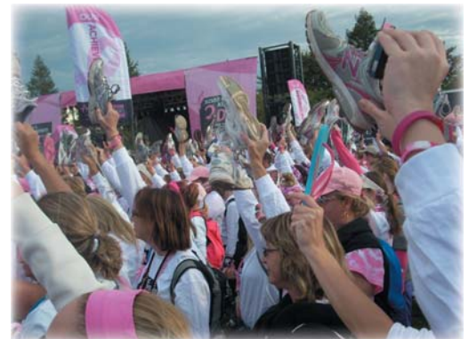
Sneakers are raised high as a tribute to the survivors at the end of the walk.